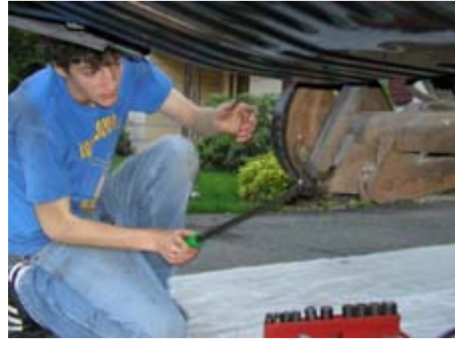
Remove the shocks