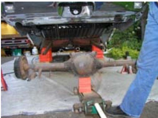
Remove the rear end from the car