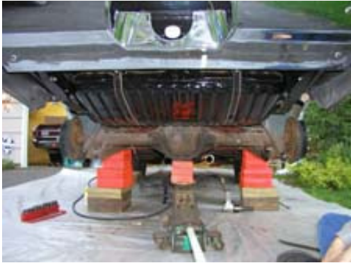
Support the rear end