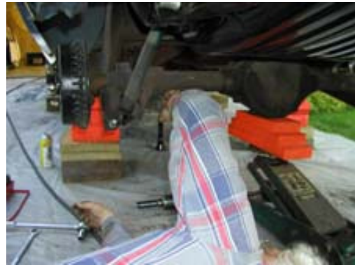
Remove bolts from the control arms