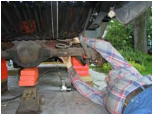
Lower the rear end and remove the springs